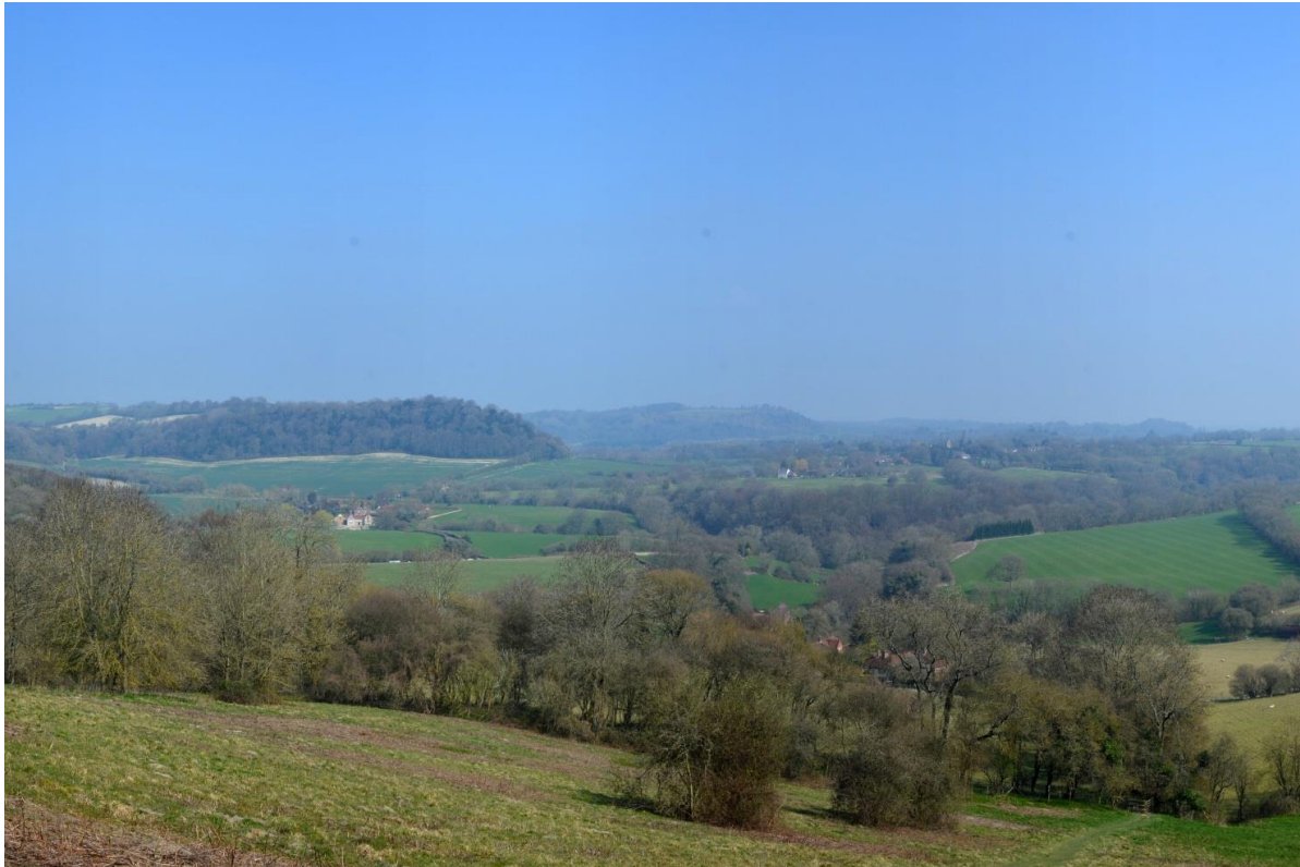
Looking from the Hangers Way south of Oakshott towards Hawkley Hanger and Noar Hill (VP24)