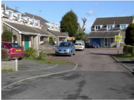
A 1960s/70s development with no play area but adequate parking. The buildings are an example of a circumvention of the number of storeys allowed. These counted as single storey at the time!

4.18 Most roads are of sufficient width with low vehicle rates that on-road parking still allows other vehicles to pass (with neither using the pavements) without causing traffic delays.