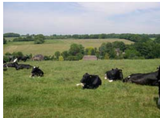
Cows to the North of the parish. The cows are in part of the SDNP close to the parish boundary. The view is looking North with Hambleton parish in the background.