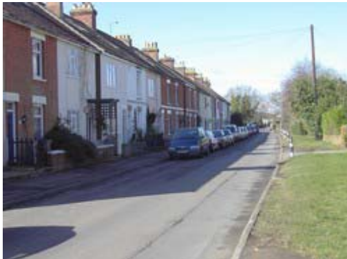
Anmore Road, one of the older village ribbon developments, with no parking spaces and on a “rat-run”.

8.7 Pedestrians are not well served in most of Denmead. The Forest Road development does provide access to both the village shops and schools in safety.