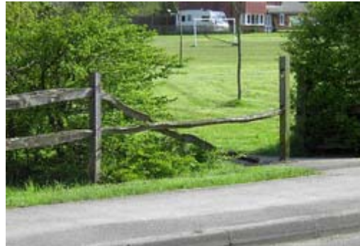
Post and rail fencing leaving the Parish Council with a high maintenance cost.

5.14 The landscaping has succeeded in making an attractive soft edge to the village with plentiful wildlife to be seen by the sharp eyed.