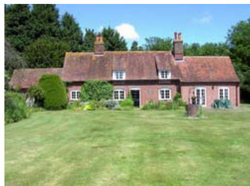
This tastefully renovated and extended building is in World's End