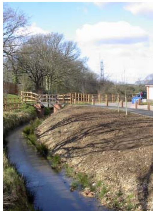
West going stream just to the west of Southwick Road

2.45 The common garden species such as Red Admiral, Peacock, Small Tortoiseshell, Comma and Holly Blue are frequent but variable in numbers from year to year. Creech Wood is rich in important butterflies including Purple Emperor and White Admiral, which are rare and classified as High Priority Species. Also seen at the top of oaks are Purple Hairstreaks. Other woodland species to be seen in Creech Wood are Silver Washed Fritillaries and Spotted Woods. Brimstones, Meadow Browns, Gatekeeper, Small Skipper, Large Skipper and Marbled Whites may be seen in the cleared areas.