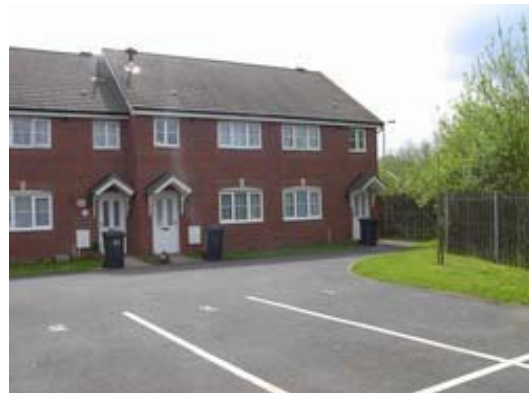
Affordable housing can fit in with other houses and look attractive.

8.13 Surface water flooding happens every time there is heavy rain for more than one hour or prolonged medium rain. In some cases the storm drains are inadequate, but all flooding should be reported to the Parish Council who will pass the information on to the Highway Authority via the Local Area Office. The regular flood at the junction of Kidmore Lane and Hambledon Road, which is on a minor crest, is an example of damaged drains. The flooding in Southwick Road (C40) close to the entrance to the recreation ground is due to over-laden drains. The flood takes up to an hour to clear after rain ceases. Flooding is also a regular feature on Fareham Road - often but not always due to the drains from the road to the ditches not being kept clear. All the surface water flooding creates a hazard to all road users.