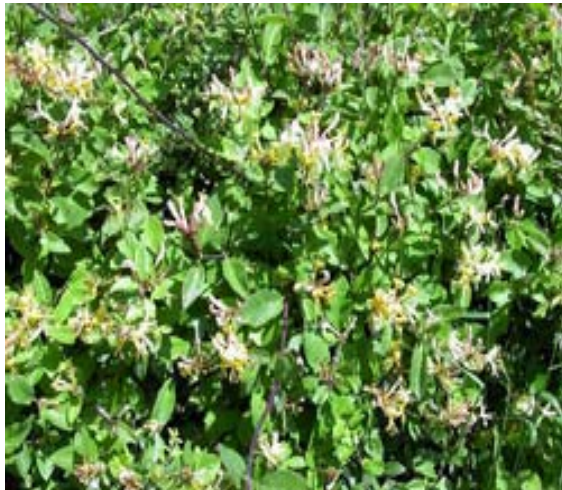
Honeysuckle in a World's End hedgerow

2.15 The hamlets at World's End and Furzeley Corner had their own Post Offices and shops.