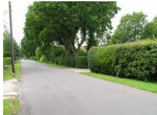
Street scene in the Anthill Common area. A quiet area with no pavements, little traffic, and generally larger houses on larger plots.

4.27 The Anthill Common area is without recreational space. There is an area on Anthill Common nominated for recreation where the slope is insufficient to be a ski slope and too sloping for any ball games. In other respects the Anthill Common area is similar to the remainder of the pre-1980 Denmead.