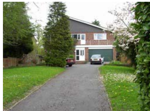
Older houses in the Anthill area are larger (and on bigger plots), than those closer to the village centre.