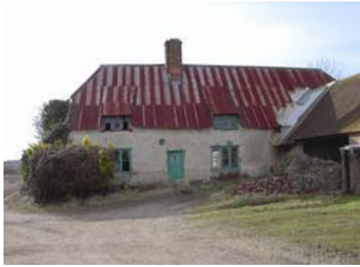
This derelict building had consent for renovation/conversion. The countryside benefits from such buildings brought back into use.