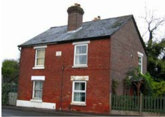
Lynden Cottage of the 19th century. Brick with slate roof, and sash windows.

3.15 Shop fronts and business premises have discreet painted signage above their windows. Some small hanging signs also exist.