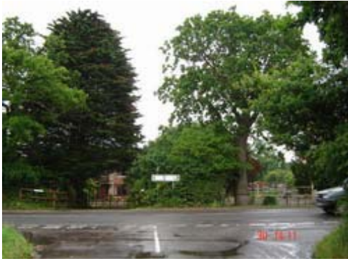
Fir trees planted to mark the establishment of the ecclesiastical parish boundary in 1880. Like many trees in the parish they are a feature which needs to be retained.