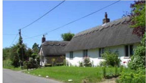
Closer to the road than most houses in the Denmead countryside this picture shows a well cared for dwelling.

Neighbourhood Plan evidence and is referred to in Policy 1: A Spatial Plan for the Parish. The area of the gap is marked on the included Map 2 Village Design Statement Area in Appendix 2.