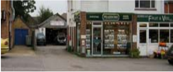
Businesses set in behind the shops.

3.8 A District Council free car park with public toilets has also been provided on this side of the road at the East end of the centre at the junction with Kidmore Lane. This is a popular meeting point for ramblers, cyclists and others wishing to explore the lanes and countryside in the parish and beyond. It is safeguarded by Policy 6 of the Neighbourhood Plan.