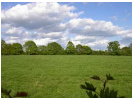
Pastures and trees were high on the list of 'most popular view' in a residents survey – although which specific view differed enormously.