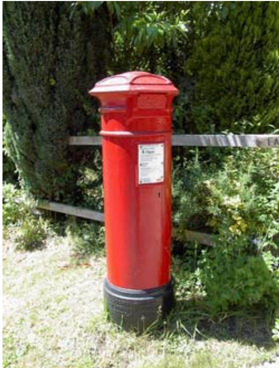
This post box, situated in Worlds End is a listed monument reflecting the age and past importance of the area.

2.55 Ashling House and gardens were replaced by post World War II houses. These were Ashling Close, consisting of detached houses; Ashling Gardens of high density, partly detached, partly semi-detached houses whilst Ashling Park Road has a lot of bungalows. North of Ashling Park Road and South of Hambledon Road (where it is heading for Waterlooville) is an area mainly of council housing but also containing some old peoples' housing.