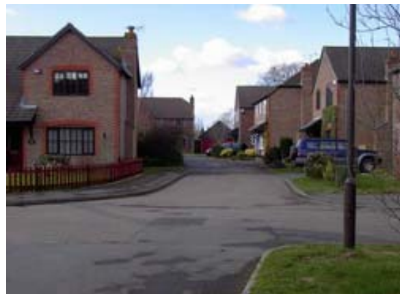
A back-fill development. Like many such estates there is a lack of children’s play facilities.

4.5 This section covers that part of the parish which to many people constitutes Denmead and is within the policy boundary shown in the Neighbourhood Plan. Parts specifically excluded are those dealt with elsewhere namely the Village Centre and the Forest Road Development.