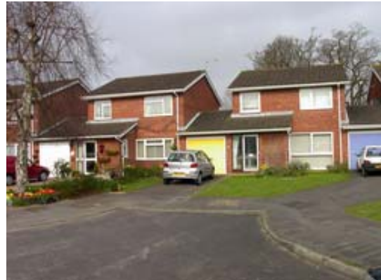
Link houses are another example of a 1970s development maximising ground use.

4.21 The Parish as a whole has only 56% of the recommended quantities of recreational spaces. Kidmore Lane and King George Playing Fields (including the additional land not belonging to the charity) are well equipped but over used. Moreover the Kidmore Lane field has drainage problems (on a spring line) which limits its use in winter.