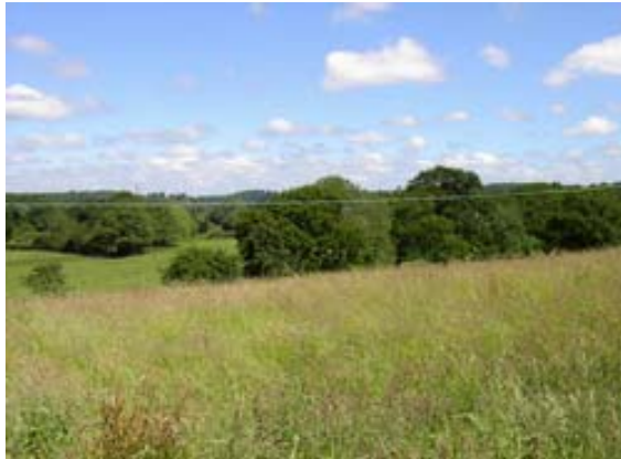
The closest trees mark the course of the West going stream close to World's End. There are remnants of water meadows above and below this point.

times there were three areas in which water-meadows were a valuable commodity to the farmers. Two of these were in the vicinity of World's End and one approximately in the Anmore area. Traces of the sluices connected with these meadows are still visible.