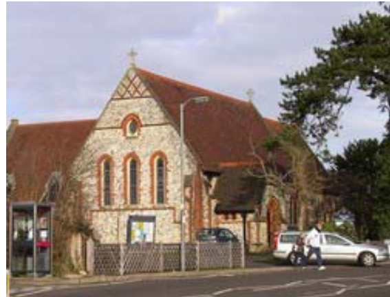
The village church showing the knapped flint and brick quoin construction typical of many of the older buildings.

3.11 Gaps between buildings in the centre vary with some being wider than the more modern developments in other parts of the village. This contributes to a feeling of spaciousness. It also enables trade deliveries to be made.