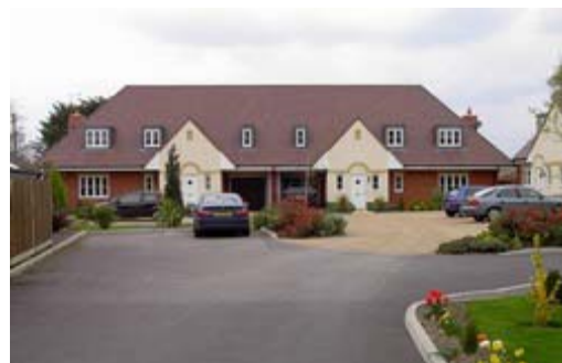
A modern but different approach to backfill development close to the village centre.