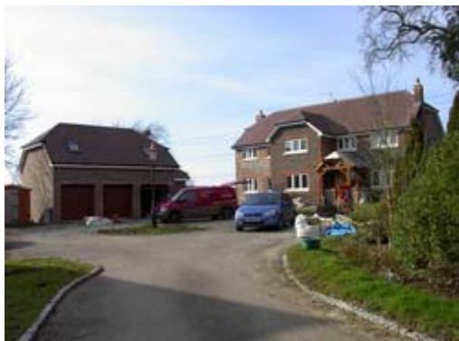
A renovated building (from the same group of farm buildings as above) is clearly better for everyone.