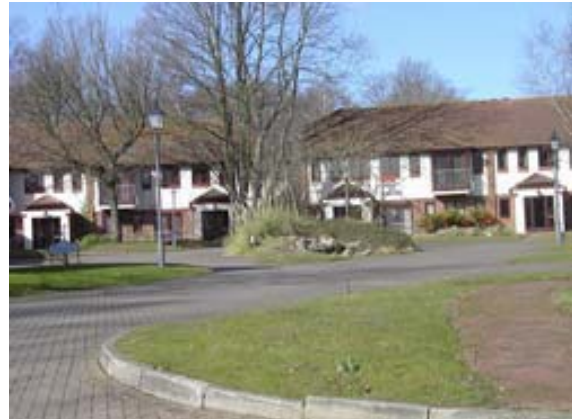
A small part of the Parklands industrial site. Excellent use of pre-existing trees with inspired landscaping

to work and how to blend in with the landscape.