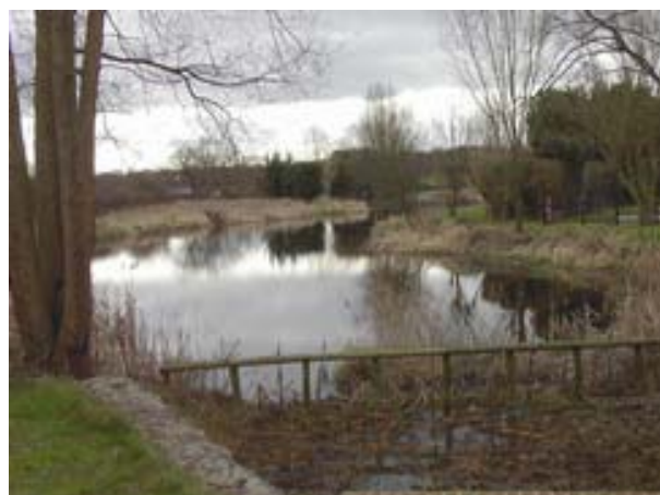
Willow Lake, World's End

due to a combination of spring lines (not all of which are in the lowest parts of the parish) and the high water table.