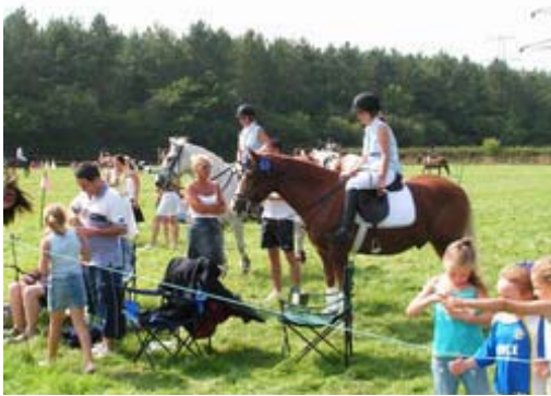
Horse riding is a family based activity. In the background part of Creech Wood provides an attractive setting.