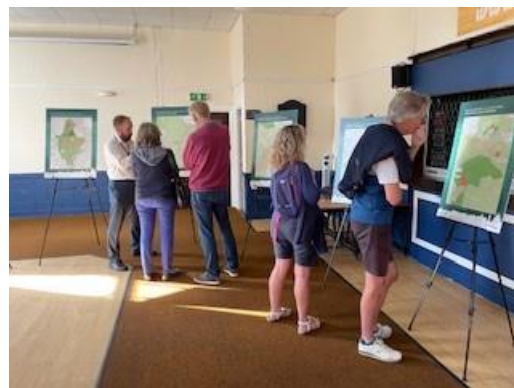
Figure 1: Wickham Drop-in Event