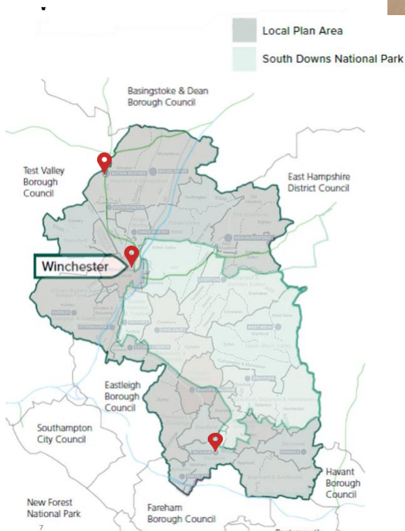
Figure 2: Distribution of Public Drop-in Events

4.2.4 By holding these events in a range of locations across the district, the team aimed to maximise peoples’ opportunity to attend. Moreover, these public sessions were held for extended periods of time from the afternoon into the evening to make these more accessible, including allowing people to attend after work. Figure 2 shows the distribution of the public drop-in events.