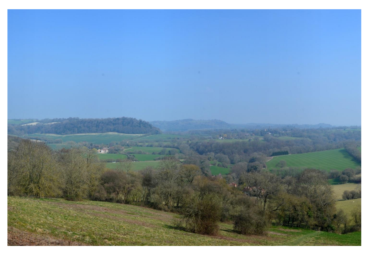
Looking from the Hangers Way south of Oakshott towards Hawkley Hanger and Noar Hill (VP24)