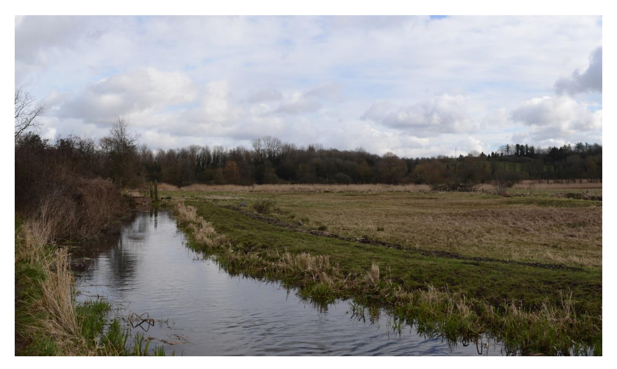
Looking north along the Itchen and adjacent watermeadows, just north of Winchester (VP62)