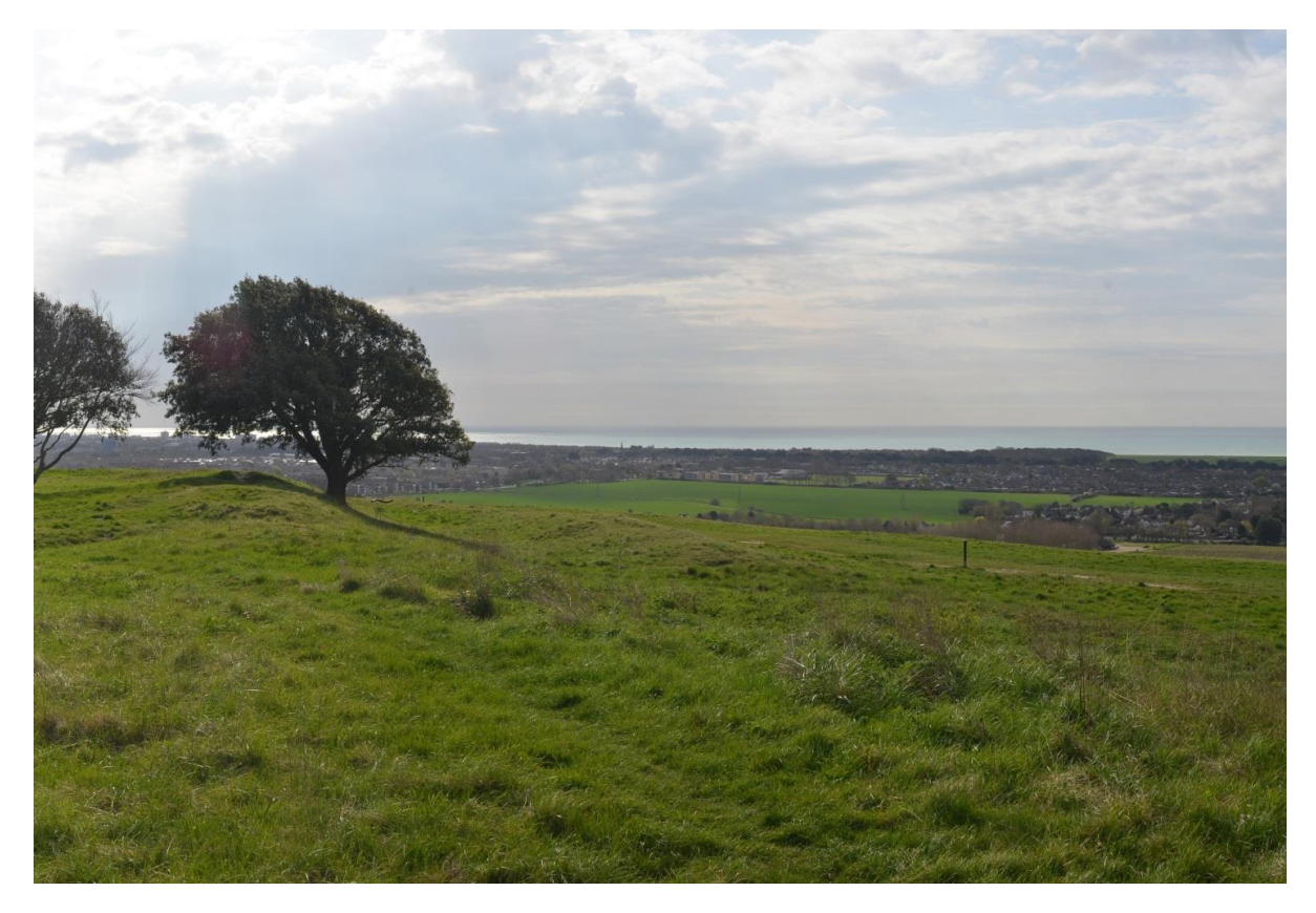
Looking south-east to Goring-by-Sea (left) and Ferring (right), from Highdown Hill (VP31)