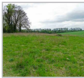
Headbourne Worthy NEEDS & OPPORTUNITIES The parish includes the 'Kings Barton' Strategic Housing Allocation which, at the time of writing, is still being built but will in time provide more public open space in all 6 categories. This assessment includes these spaces but not the anticipated final population of the MDA so will need to be re-adjusted in due course. Without Kings Barton the parish would have a deficit of public open space (0.37 ha) but with Kings Barton there will be no shortfall, approximately +21 ha.