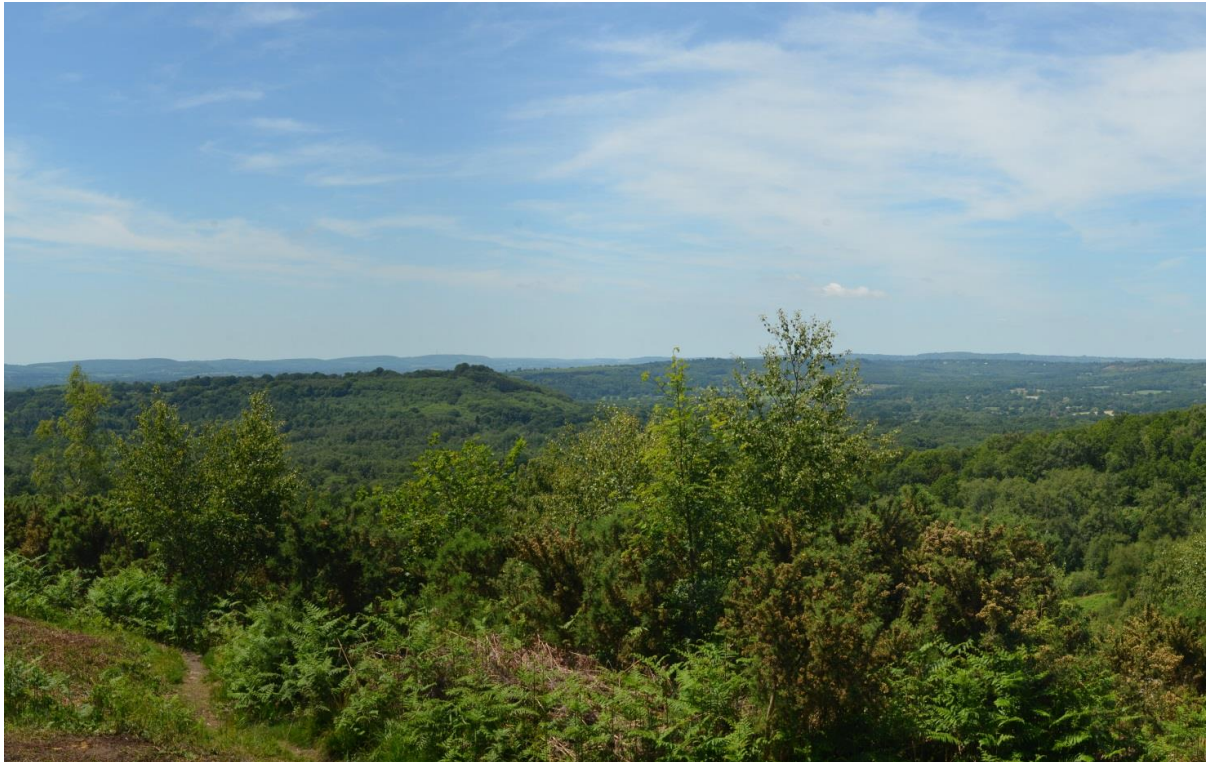
Looking west from Woolbeding Common towards the wooded slopes of Dunner Hill and, in the distance, the downland scarp south-west of Petersfield (VP17)