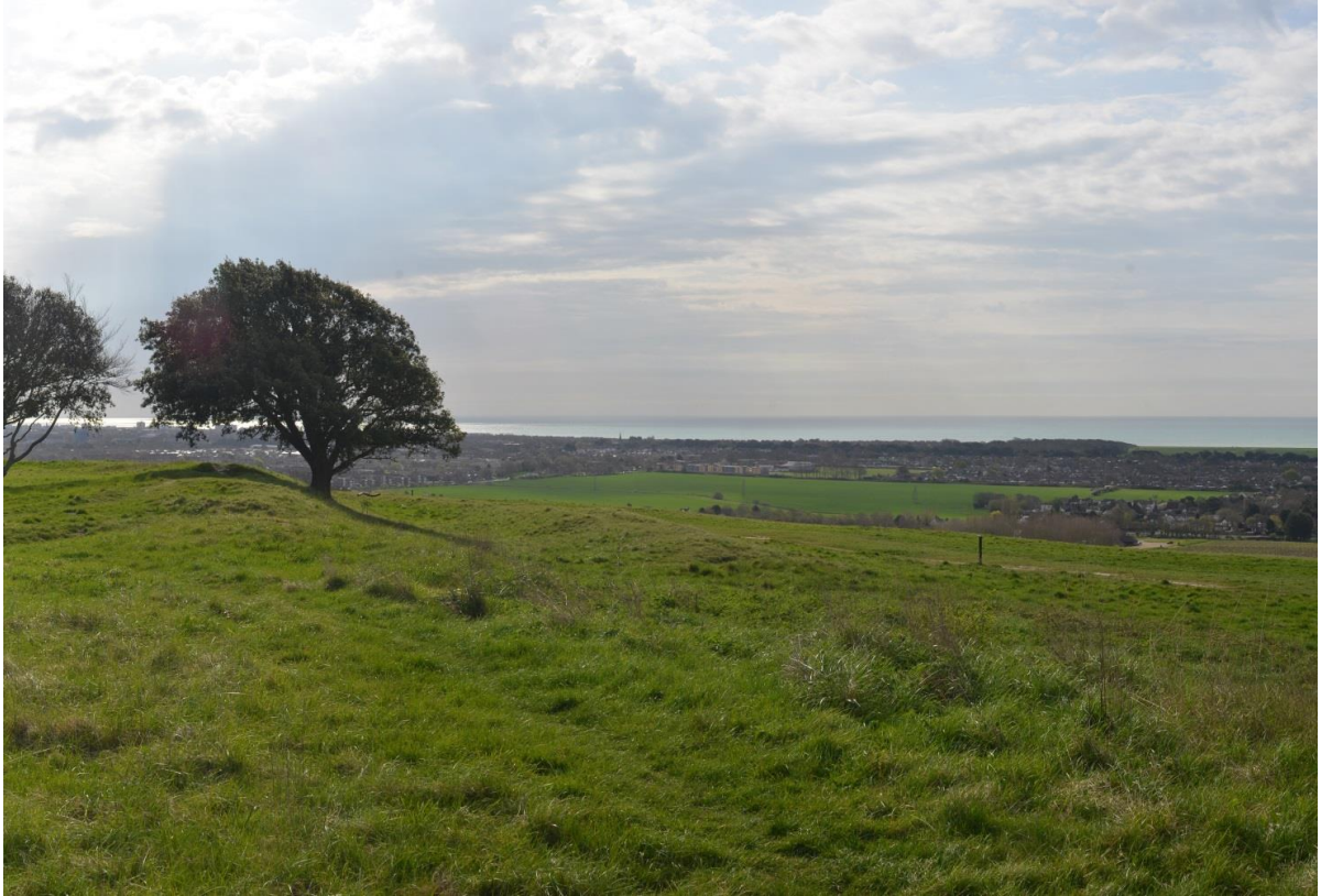
Looking south-east to Goring-by-Sea (left) and Ferring (right), from Highdown Hill (VP31)