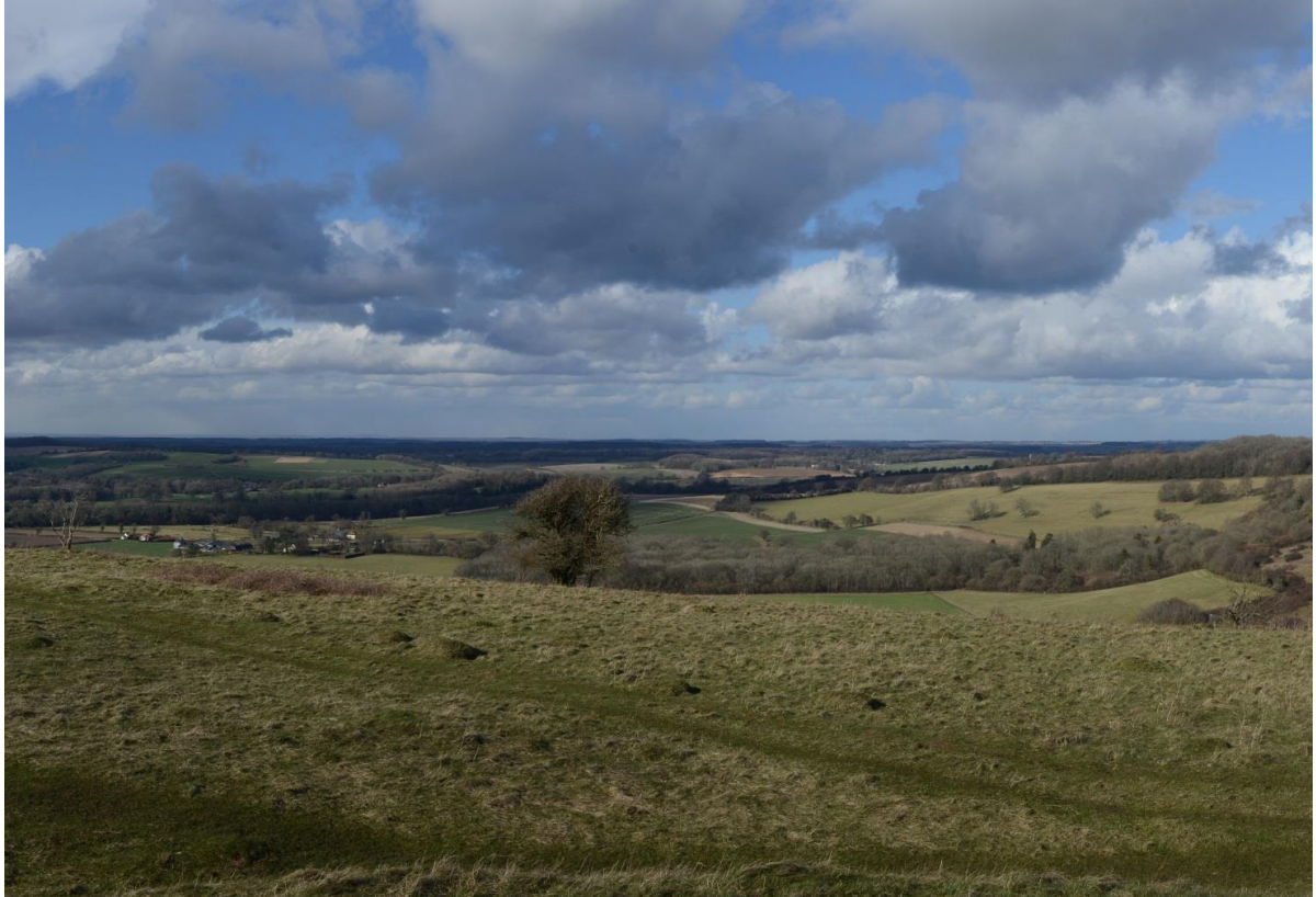
Looking north from Old Winchester Hill (VP5)