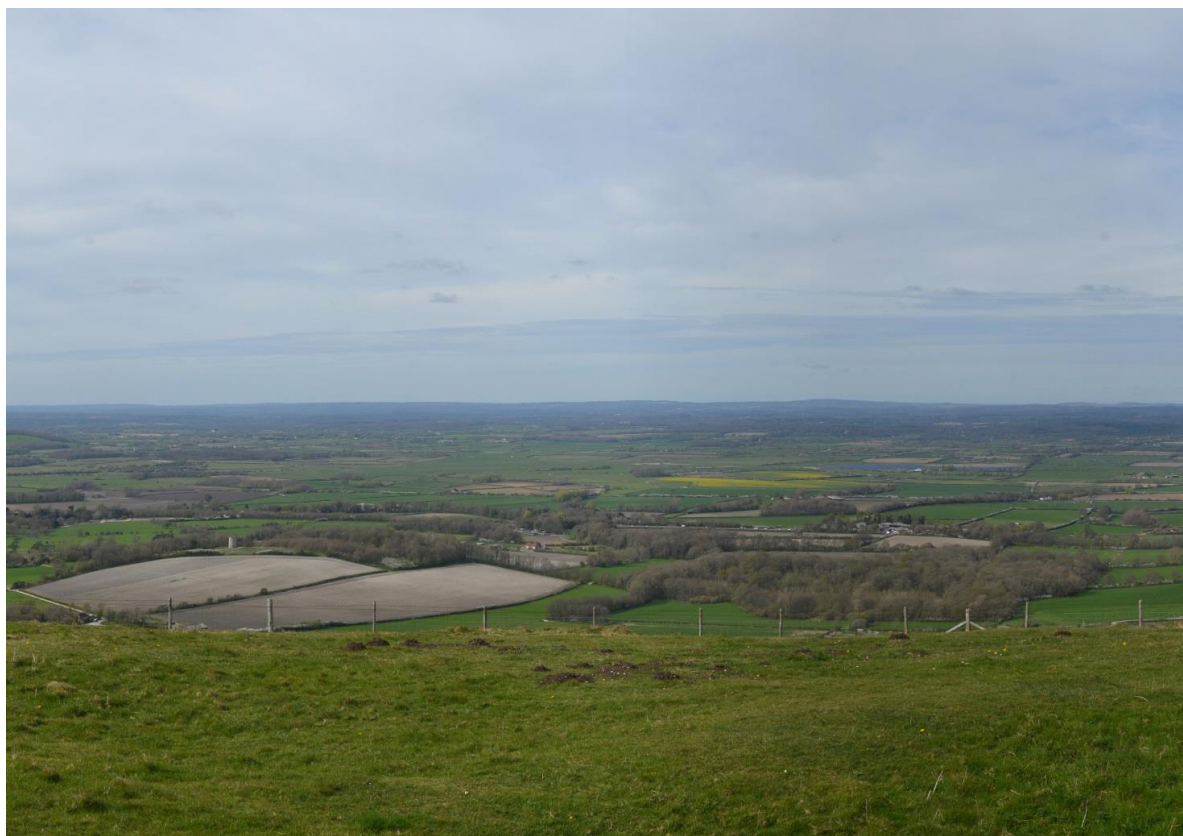
Looking north from Firl Beacon, across the Low Weald, with High Weald hills in the distance (VP7); the National Park edge is marked by the A27, which runs across the view just beyond Firl Tower and, to its right, Compton Wood