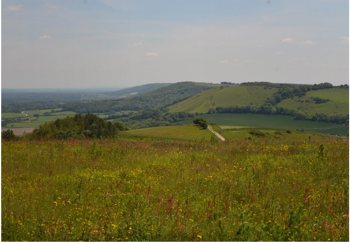
Looking east from Beacon Hill (VP12) along the scarp edge towards the distinctive folds of Treyford Hill and the wooded Linch Down beyond