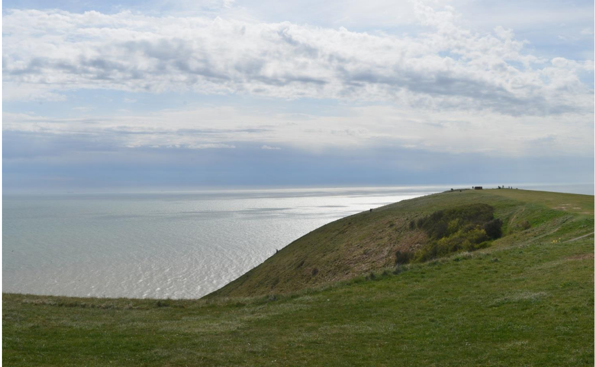
The view out to sea from Beachy Head (VP1)