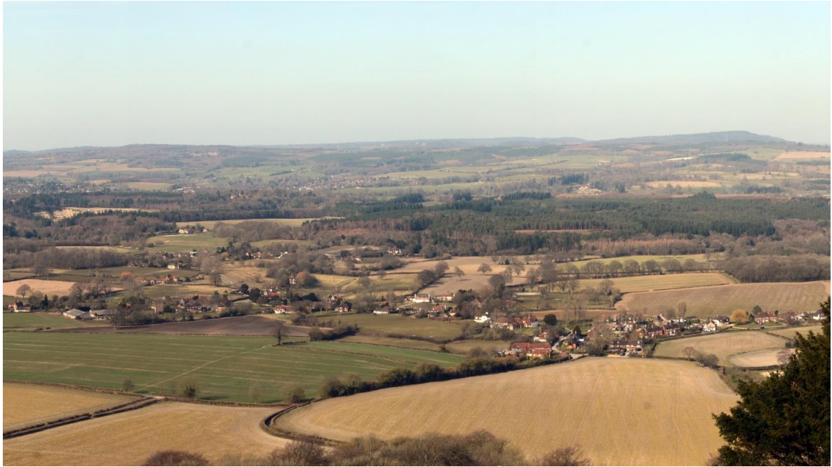
Looking north from Heyshott Down over the village of Heyshott, the wooded commons of Graffham and Ambersham and the Rother Valley settlements of Midhurst and Easebourne, to the Greensand Hills around Henley and, in the distance, the peak of Blackdown (VP40)