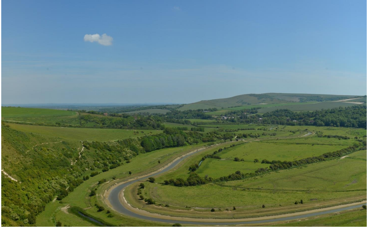
Looking north-east along the Cuckmere Valley from the High and Over White Horse (VP6)