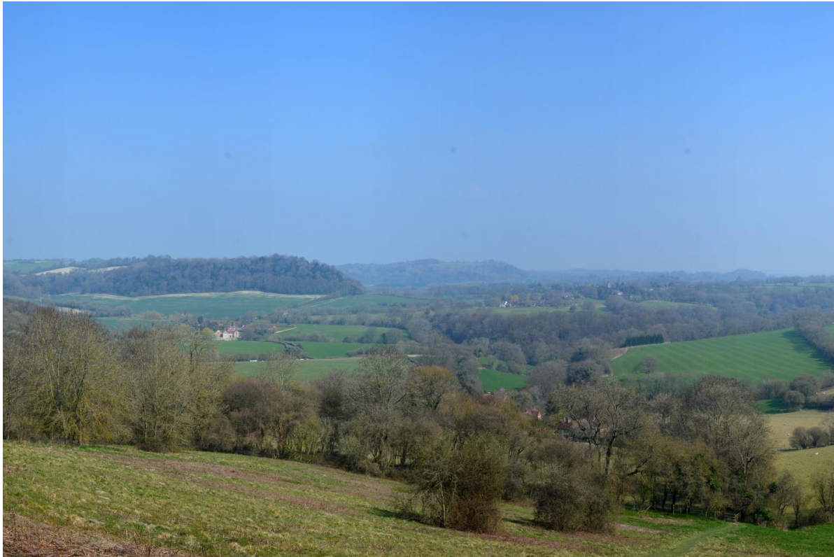
Looking from the Hangers Way south of Oakshott towards Hawkley Hanger and Noar Hill (VP24)