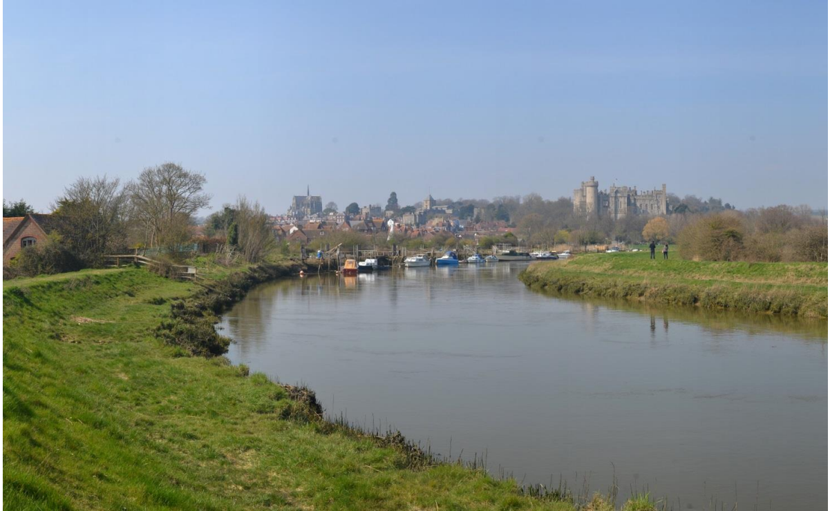
Arundel Castle and town from the River Arun (VP19)