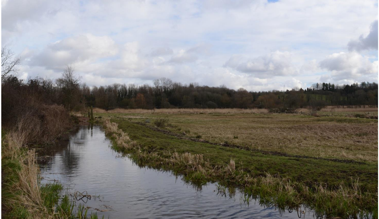
Looking north along the Itchen and adjacent watermeadows, just north of Winchester (VP62)