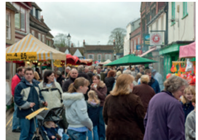
Below Right: The Vibrant High Street