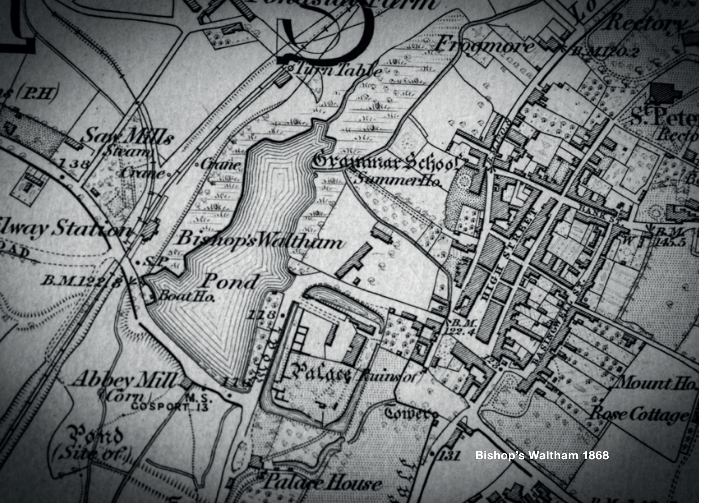
Bishop's Waltham 1868