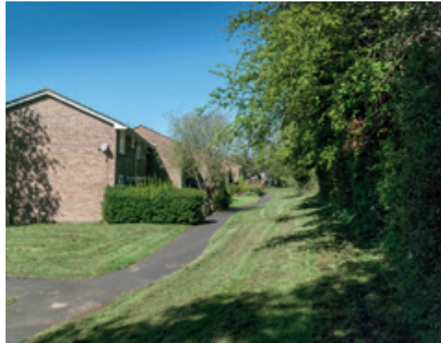
Left: The Rural Edge to Ridgemedede

These features define the distinct nature of Bishop's Waltham that future developments should preserve.