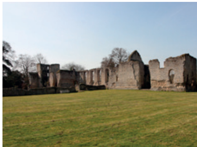
Below Left: The Bishop's Palace Ruins