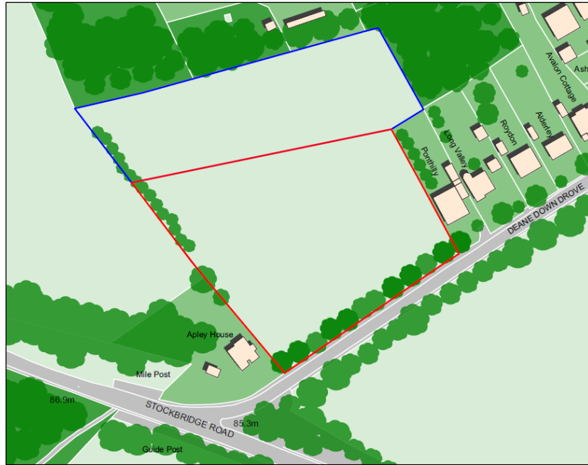
Application site extents

2.3 The site lies immediately adjacent to the existing settlement boundary for Littleton . The gap between Harestock and Littleton is located to the south east (Policy CPI8). An extract from the Winchester North and Littleton proposals map (Development Management and Site Allocations (LPP2) is shown below: