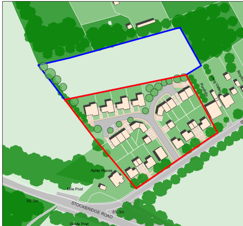
Potential layout of residential development and new access