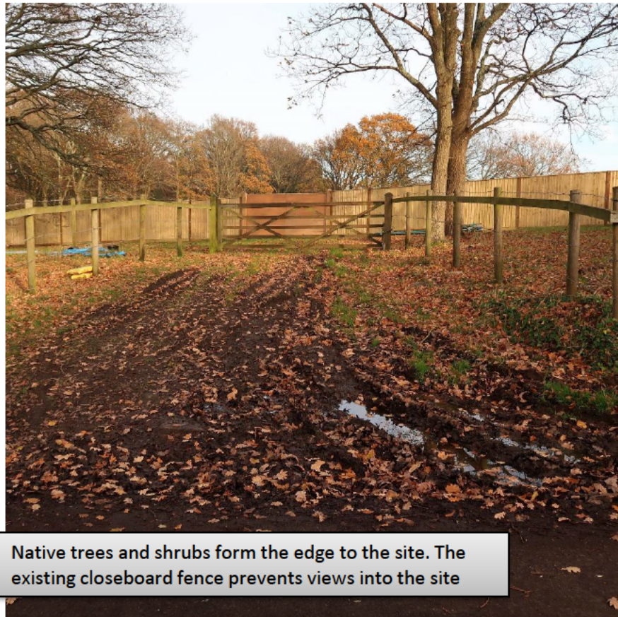
Native trees and shrubs form the edge to the site. The existing closeboard fence prevents views into the site