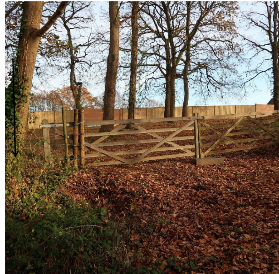
PHOTO 4 2021 DOUBLE GATES AT ENTRANCE B